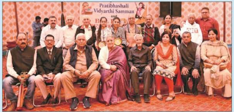
MS Faridabad organized a 'Mini Mela' on 1st Dec 2019