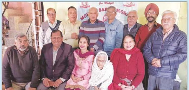
MS Mohali Monthly Meeting on 8 Dec 2019