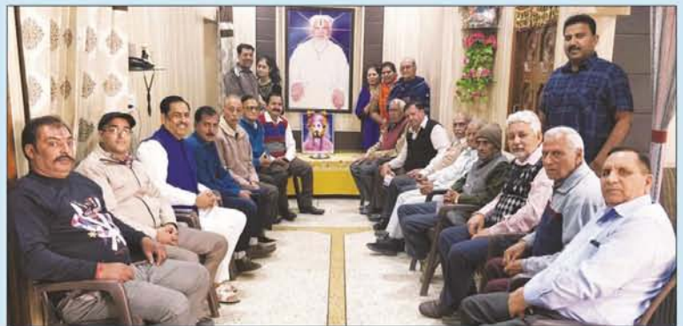
MS Jagadhari Workshop Monthly Meeting on 1 Dec 2019