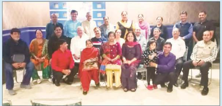
MS Rohini Pitampura Monthly Meeting 24 Nov 2019