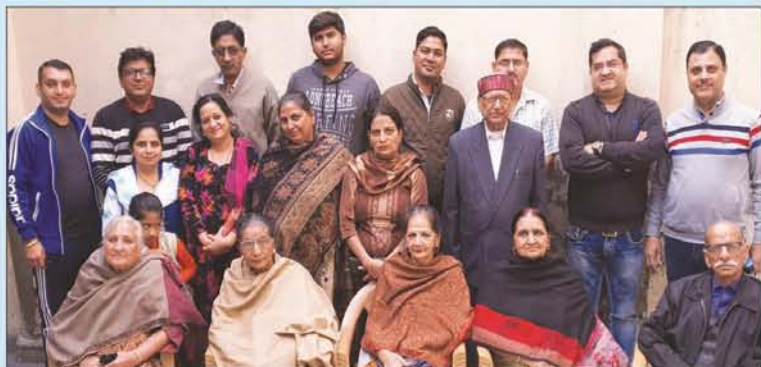
MS Yamuna Paar Monthly Meeting on 1 Dec 2019