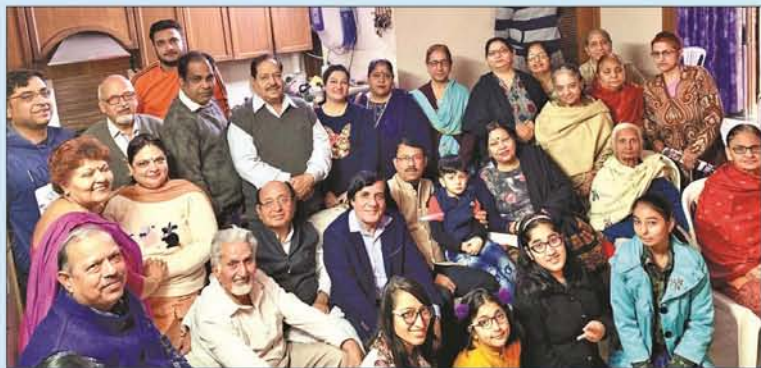
MS West Zone Monthly Meeting on 8 Dec 2019