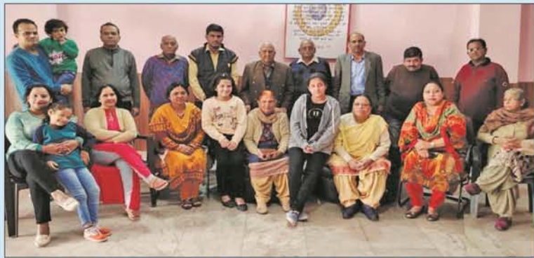
MS Ambala City Monthly Meeting on 1 Dec 2019