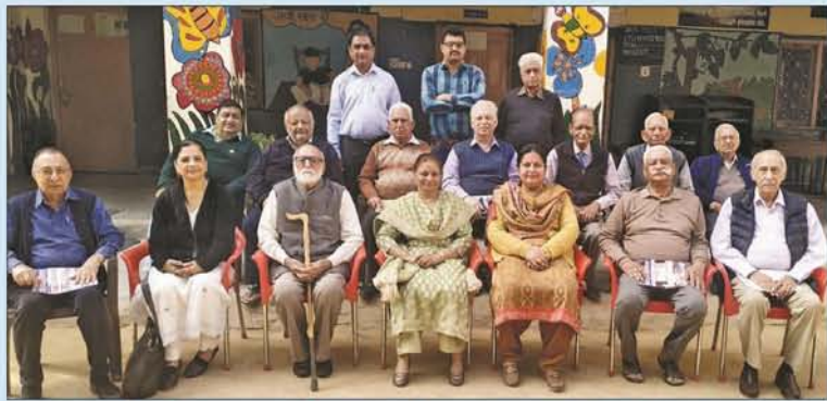
MS Gurgaon Monthly Meeting on 1 Dec 2019